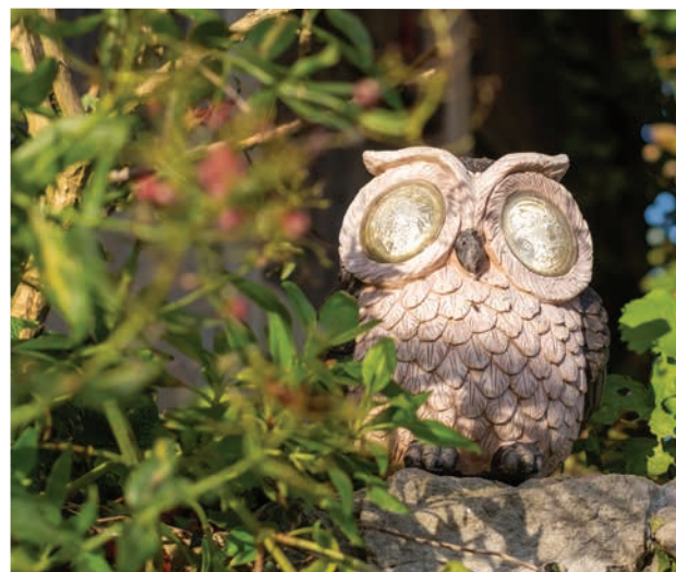
Our homes are good places to live and work

“ I love you all, I never thought I would say that, the home has taught me everything I know, how to express, how to cope, how to succeed. I came here a diffe rent person to the person leaving, a better person. ”